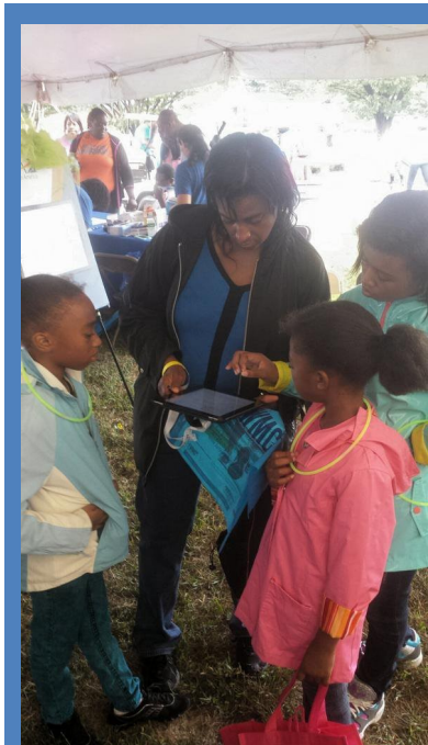
A family takes mental health screenings at the Convoy of Hope's Health Care and Humanitarian Relief Event.

MHA and the American Red Cross launched a partnership between local affiliates of each organization. Interested MHA and ARC affiliates are contacted to help provide mental health services in case of a disaster.