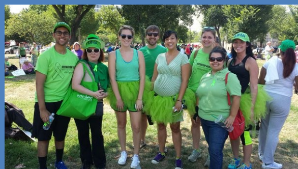
MHA staff joined with over 400 advocates to march on the Capitol.

Throughout the year, the RPC members worked together to impact state legislation and regulations across the country.